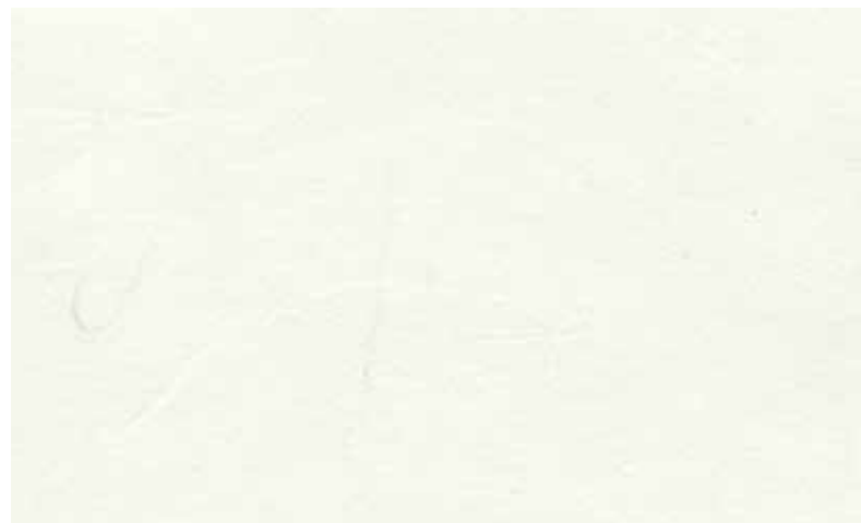
SP-0002 White Unryu Shoji Paper Roll