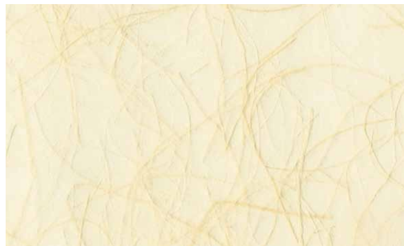
M-0208 Tenjin Natural