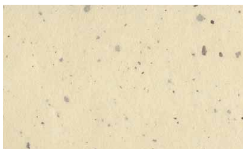
M-0318 Kasuirishi HW