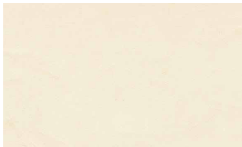
M-0256 Kumohada Unryushi 1