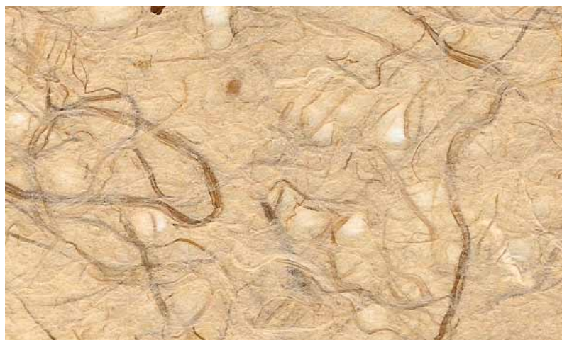
M-0521 Kawairi Rakusuishi - "Flecked Nest"