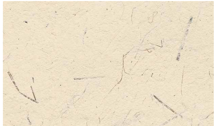
M-0246 Hakudoshi Susa