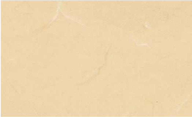
M-0259 Kumohada Unryushi 4