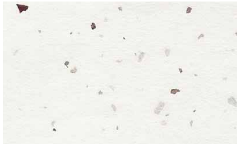
M-0204 Kasuiri White