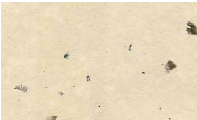
M-0248 Hakudoshi Koba