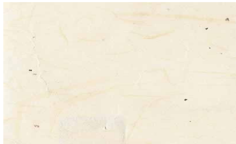
M-0249 Mingei Unryushi White