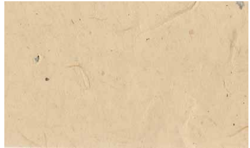
M-0265 Gampi Unryushi/1