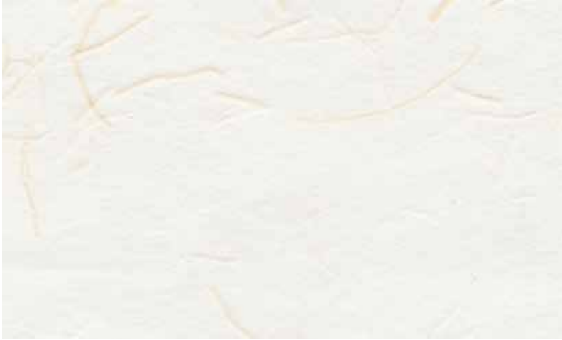
M-0211 Manilashi White