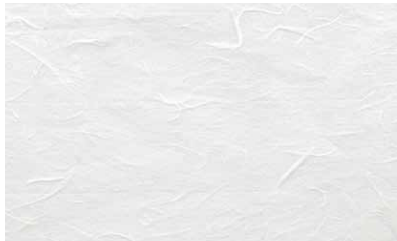
E-112 White Unryu LW