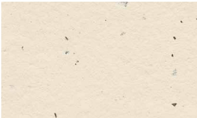
M-0247 Hakudoshi Oba