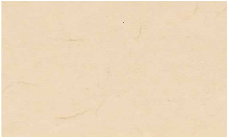
M-0261 Kumohada Unryushi 6