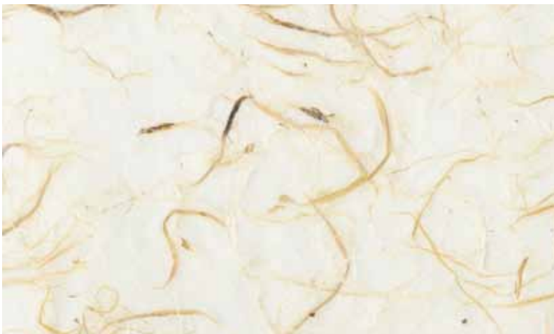
HK-0055 Unryushi Natural

Paper Connection's Textured & Flecked Papers, made from mulberry (kōzo) and hemp fibers, can be painted or printed on. The fibrous and translucent papers are wonderful for lampshades or shoji screens.