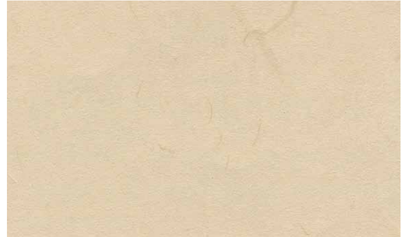
M-0262 Kumohada Unryushi 7